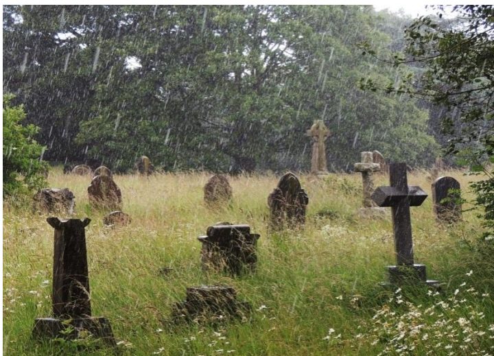
A cemetery shower - 25 June 2016!

Of course some of the female Friends tend to get a little sensitive when it comes to getting their hair wet, as illustrated above. I am happy to report that the shower didn't last long and maintenance work soon resumed.