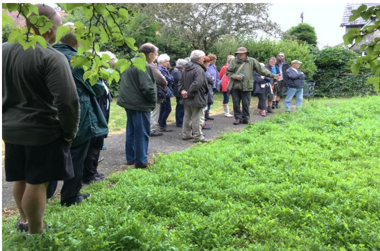
Left: Flora and Fauna Tour